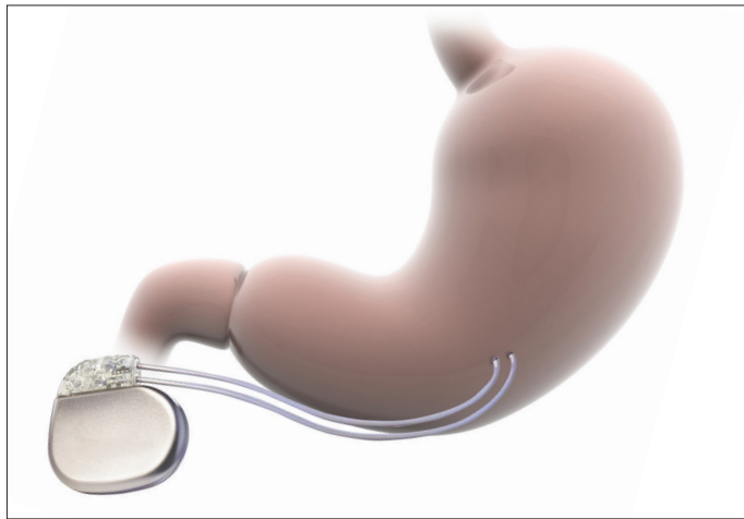
Figure 1. Enterra Therapy System

The neurostimulator (Figure 1) produces the electrical pulse that stimulates your stomach muscle. A special battery and electronics inside the neurostimulator control the electrical stimulation. The neurostimulator connects to the leads to carry the electrical pulse to your stomach muscle.